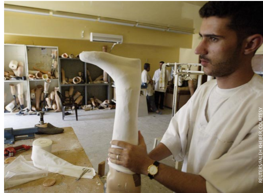
Technician prepares prosthetic leg to be fitted on Iraqi amputee